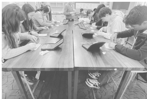
This isn't Going to Hurt Medic Day

Sixth form Peer Support Leads (PSLs) across our schools have continued their work as mentors this term, providing invaluable support through one-on-one guidance. Joint training sessions this term have covered peer mentoring in the workplace and opportunity for reflection on experiences and discussion around tricky scenarios. As our PSLs head into their exams we look forward to recruiting the new cohort. We would like to thank the existing PSLs for all their hard work, care and support over the last year.