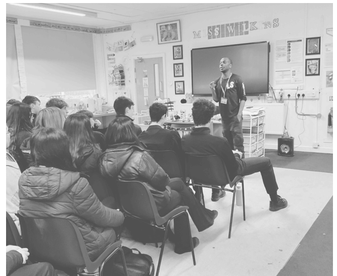
InspirED Y10 Event

The energy was electric at Fitzharrys School as 180 students from across the OX14 Learning Partnership gathered for InspirED . Moving away from traditional lectures, the team from Loudspeaker led a high-octane morning of workshops focused on public speaking, networking, and the power of authenticity. From inflatable unicorns to interactive storytelling, students from six different schools connected, laughed, and gained the confidence to use their ‘sincere voices.’ As one participant shared, the day was ‘energising’ and inspired them to be their genuine selves. The second core event of the year, InspirED was an opportunity for students to meet new people, hear from inspiring voices and step outside of their comfort zones.