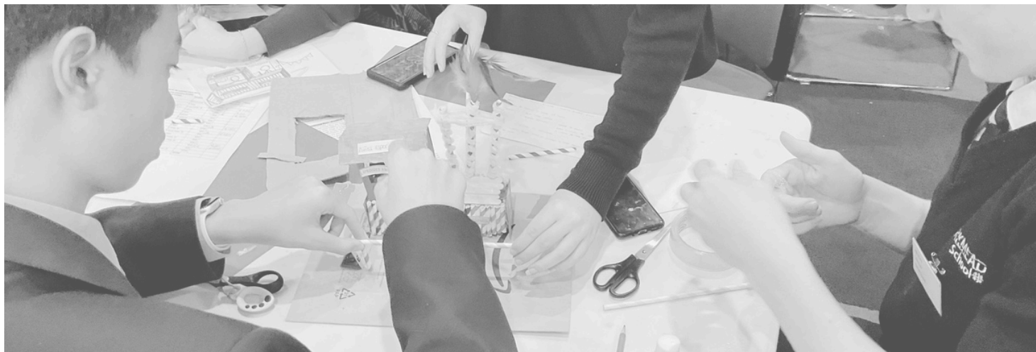
Business Language Challenge Event

A summary of partnership activity for schools in the OX14 learning partnership.