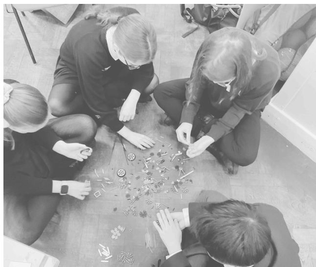
ChallengED STEM Event

Over 100 Year 8 students from across schools recently participated in ChallengED , a highly engaging, hands-on STEM Challenge Morning hosted by Larkmead School. Students worked in mixed-school teams on activities delivered by external groups; Space Store and House of Fun. Challenges focussed on developing essential skills in problem-solving, communication, and teamwork. This event provided a valuable opportunity for students to engage creatively with STEM concepts outside of the classroom, with 97% of attendees saying they would recommend the day to a friend. Students particularly enjoyed meeting new people and successfully challenging themselves throughout the morning.